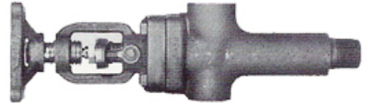
Q76 BL Gauge Valves

Renewable Seat: The removable seat may be replaced.